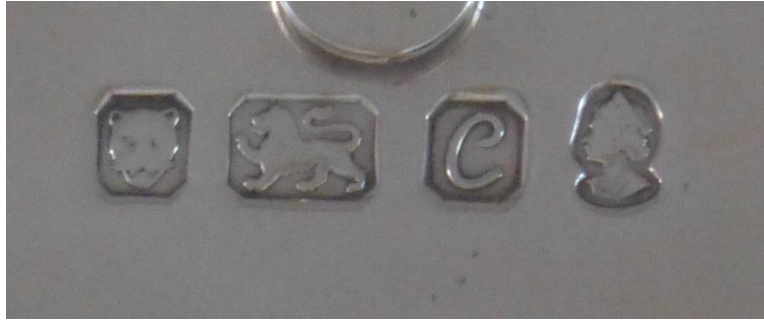
The IESF President's Badge and Its Hallmark