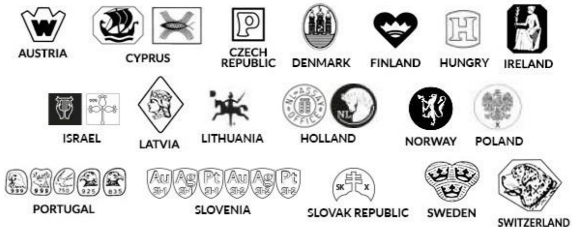
A Selection of International Assay Office Marks