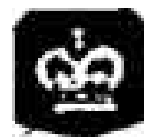
Sheffield to 1974