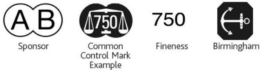
An Example of a Convention Hallmark

In order to facilitate international trade in precious metal items, an international convention was ratified by a number of European countries in the 1970s to harmonize standards and marking. This resulted in the introduction of Convention hallmarks, which are recognized by all signatories to the Convention. These marks may be struck in addition to or in place of the UK assay office hallmarks. A Convention hallmark consists of a COMMON CONTROL MARK, a STANDARD OF FINENESS, an ASSAY OFFICE MARK and a SPONSOR'S MARK. The common control mark is in the form of a balance in a shield of a shape indicating the precious metal. The millesimal fineness may be included in this, or shown in a separate mark