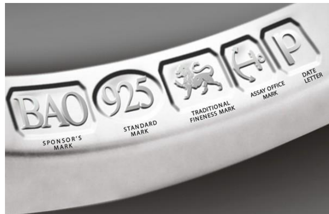
Components of a Hallmark (theassayoffice.com)

The purpose of hallmarking is to demonstrate the level of purity of a precious metal, and a hallmark traditionally consists of four components indicating the assay office in which it was tested, the fineness of the metal, the maker (or sponsor) of the item, and the date of assay: